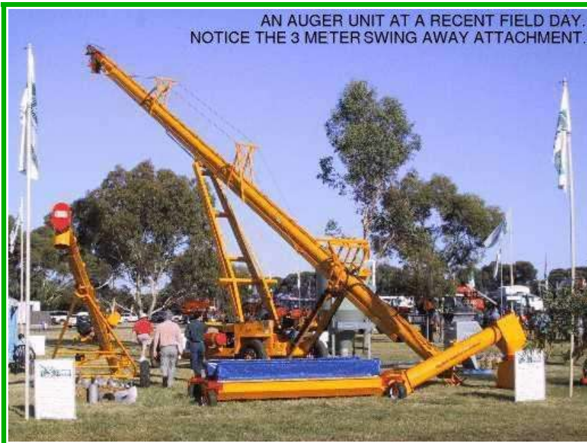
AN AUGER UNIT AT A RECENT FIELD DAY. NOTICE THE 3 METER SWING AWAY ATTACHMENT.

B. Keogh & Sons Manufacturing Pty Ltd is Australia's trusted name in commodity handling equipment. For more than 45 years KEOGH'S have been developing and manufacturing grain handling products to meet the needs of rural and commercial producers. In an industry where experience and quality do matter B. Keogh & Sons Manufacturing Pty Ltd is the undisputed leader.